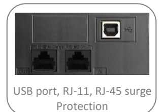
USB port, RJ-11, RJ-45 surge Protection