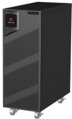
Battery Pack with 2x Battery Sets inside (Each battery set contain 24x 12V/9Ah batteries) Datasheet: Link Item No.: 10120559