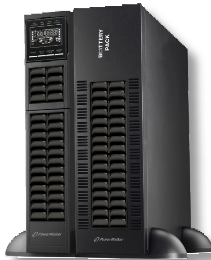
VFI 10000 RMG

Access to the battery compartment is possible through the front panel. Battery replacement can be done without the need to remove the UPS from the operation.