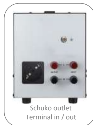
Schuko outlet Terminal in / out