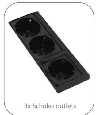
3x Schuko outlets