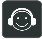
All Day Wearing Comfort