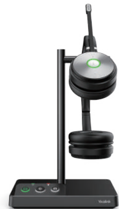
WH62 Dual Teams WH62 Dual UC

Based on hundreds of headform evaluations and thousands of wearing comfort tests, WH62 well meets the ergonomic requirements. Besides, with premier soft leather cushions and lightweight design, you can wear it all day comfortably. For more workspace freedom, WH62 can also free you up to 160m away from the desk.