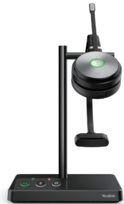
WH62 Mono Teams WH62 Mono UC