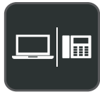
Multiple Devices Connection