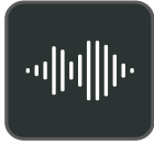
Optima Audio Experience