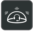
Acoustic Shield Technology

The Yealink WH62 is a new entry-level DECT wireless headset, with WH62 Dual and WH62 Mono two models. Work seamlessly with major UC platforms and integrate natively with Yealink IP phones. For crystal sound experience, Yealink Super Wideband Technology and Acoustic Shield Technology make you talk and hear clearly during phone calls and video conferencing. With easily on-ear control, interruption free, comfortable wearing, WH62 is a nice partner either for communicating or collaborating.